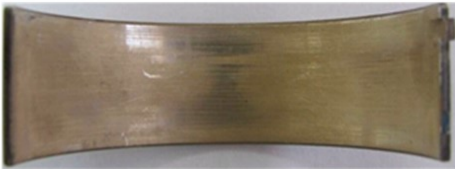
King “next generation” bearing after one season racing

The overlay pairs extremely high fatigue strength and Wear resistance with high seizure resistance. This is due to the combined properties of its base metal and special solid lubricant additives.